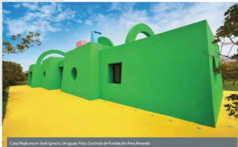
Casa Neptuna en José Ignacio, Uruguay.